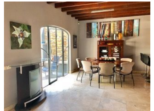
Included in Sale

Water Purification Water Cistern/Storage Water Electric City Sewage