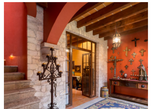
Included in Sale