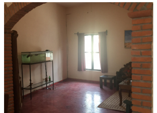
Included in Sale