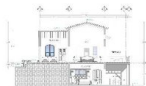
CORTE TRANSVERSAL A-A'