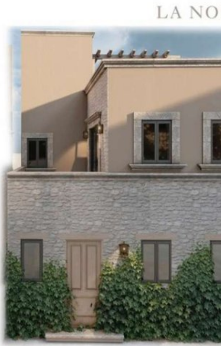
PROYECTO RESIDENCIA 15