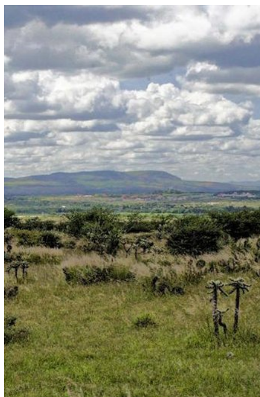
PROPERTY Inde, Guanajuato, México